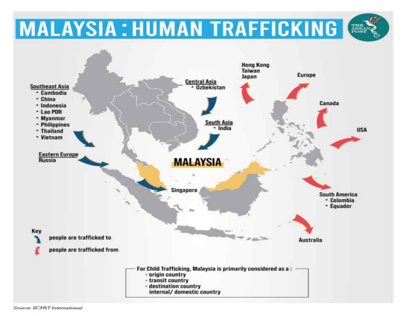
Figure I: Human Trafficking in Malaysia

Malaysia is considered the destination and transit country for human trafficking. SUHAKAM in 2018 reported that because Malaysia is a popular destination amongst foreign workers with its attractive economy these workers are exposed to become victims of sexual and labour trafficking.