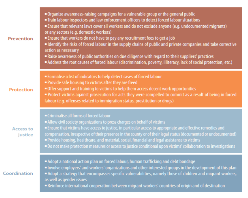
Table II: Human Trafficking in Malaysia

Table 1 shows examples of impacted actions that governments take to stop forced labour based on the ILO's 2014 Protocol and Recommendation: